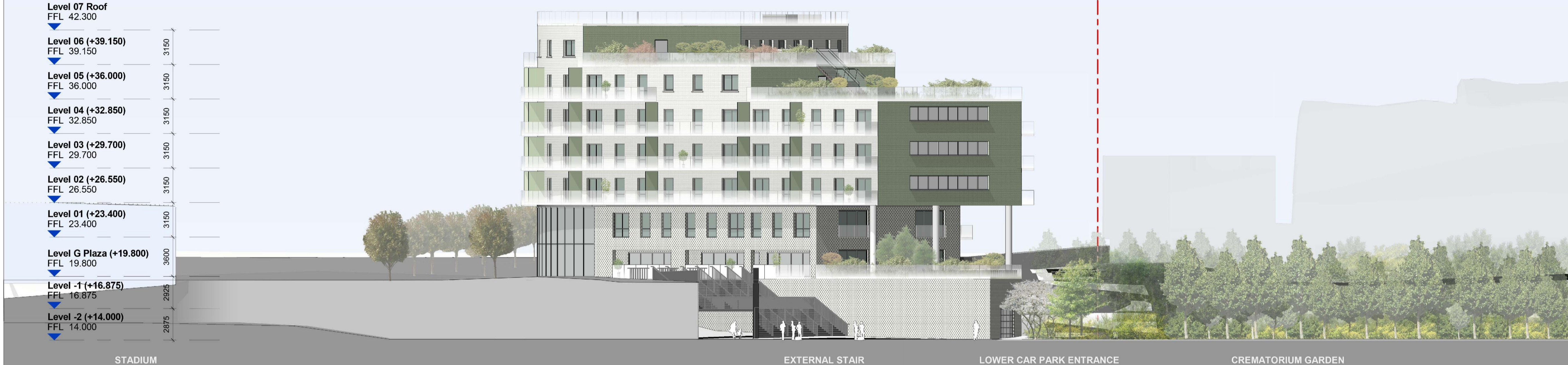
1 North Elevation 1 : 200

Level 07 Roof FFL 42.300 Level 06 (+39.150) FFL 39.150 Level 05 (+36.000) FFL 36.000 Level 04 (+32.850) FFL 32.850 Level 03 (+29.700) FFL 29.700 Level 02 (+26.550) FFL 26.550 Level 01 (+23.400) FFL 23.400 Level G Plaza (+19.800) FFL 19.800 Level -1 (+16.875) FFL 16.875 Level -2 (+14.000) FFL 14.000