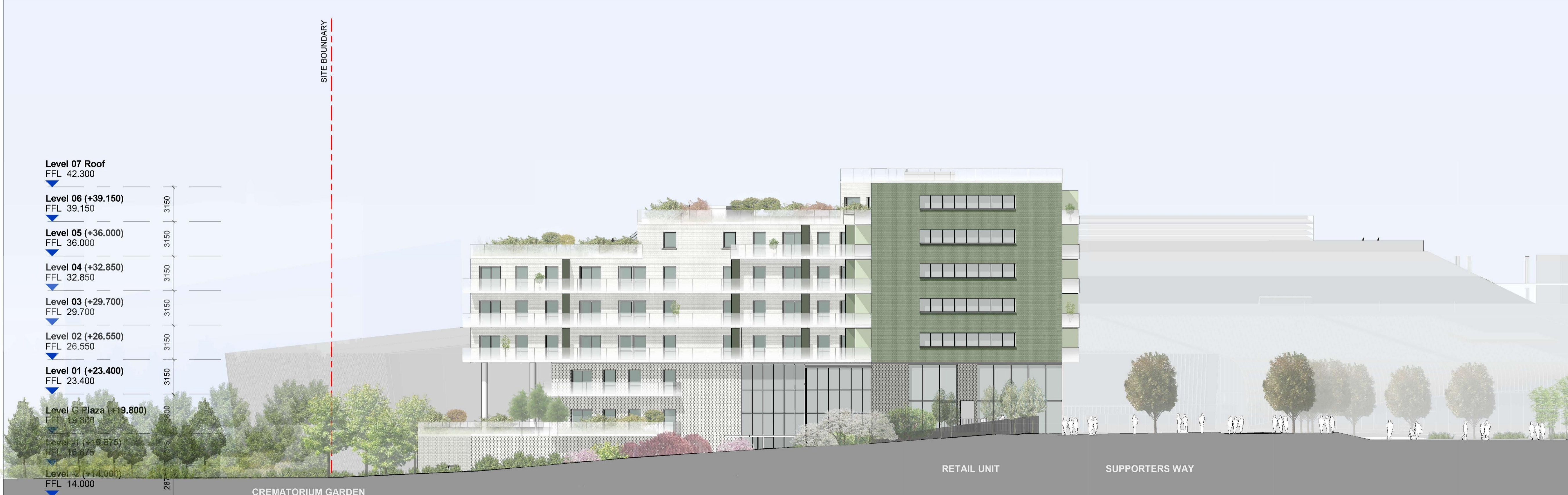
2 South Elevation 1 : 200

Rev:P02 Date:08.03.2018 Drw:MI Chk:SG Layouts revised to reflect reduced site area Rev:P01 Date:21.04.2017 Drw:LB Chk:SG Issued For Planning